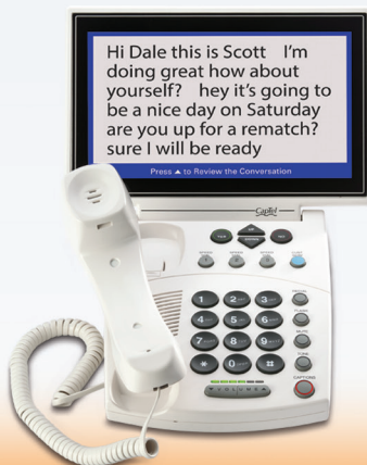
Hamilton® CapTel® 880i