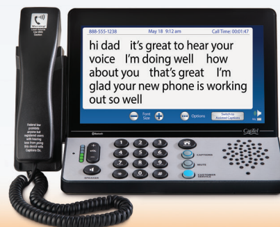
Hamilton® CapTel® 2400i