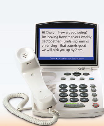
Hamilton® CapTel® 840i