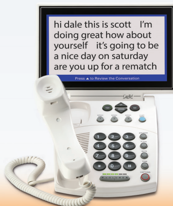
Hamilton® CapTel® 880i