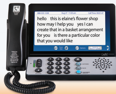
Hamilton® CapTel® 2400i