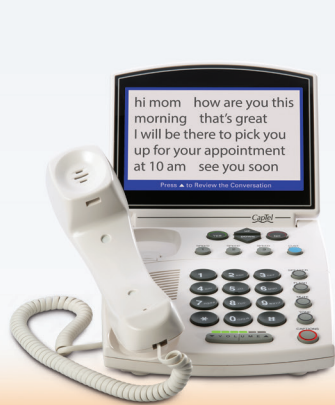
Hamilton® CapTel® 840i